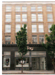
CLERKENWELL ROAD EC1 - 15,500 SQ FT VALUED ON BEHALF OF PRIVATE CLIENT