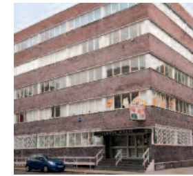
BRUNSWICK PLACE N1 - 17,000 SQ FT OFFICE BUILDING VALUED ON BEHALF OF PRIVATE CLIENT